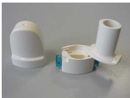
Dry powder inhaler used during the product development. RS01/7 (Plastiapipe S.p.a.)